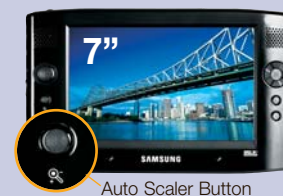
Auto Scaler Button